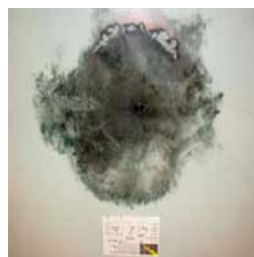
Panel front side

Each of the test articles show Zone 1A strike point damage contained to less than a 6 inch (15.2 cm) diameter area, with minimal penetration over a two inch diameter area. No punch through or damage was observed on the back side of the panels.